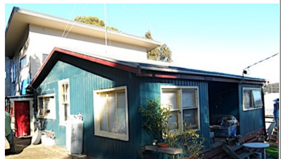
RIGHT: 59 Aireys Street, Aireys Inlet