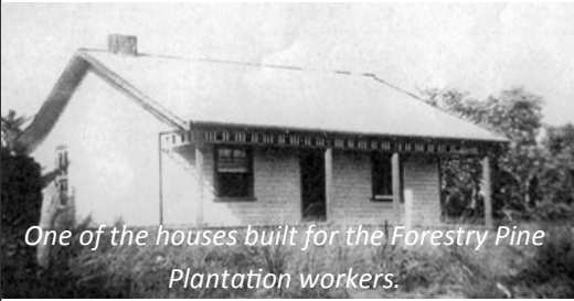
One of the houses built for the Forestry Pine Plantation workers.

Most people thought the Pine Plantation development at Anglesea, after the First World War was a disaster. The pines did not grow as anticipated. Although many men were employed to prepare the ground, plant the seedlings and care for them, the experiment was not successful. The ground was not fertile enough and the rainfall was too low. A lot of time and money was wasted and fire eventually took most of the poor specimens of trees that struggled to survive.