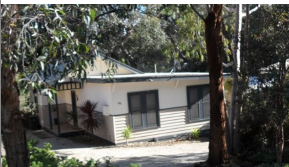
LEFT: 65 Camp Road, Anglesea