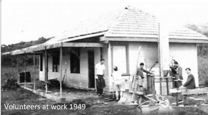
Volunteers at work 1949

The first weekend of work was taken up with numerous jobs - making an area for gravel and sand, making the 'shed' out of the crate and setting it up, rough marking out of the units and clearing the ground. A work party organizer was appointed by the committee. He was responsible for detailed organization, obtaining fuel, attending to finance, consulting technically, and arranging for appropriate tools to be taken to the site. Two important projects had to be organized, namely the mixing of concrete and the replacement of the hessian outhouse with the septic tank.