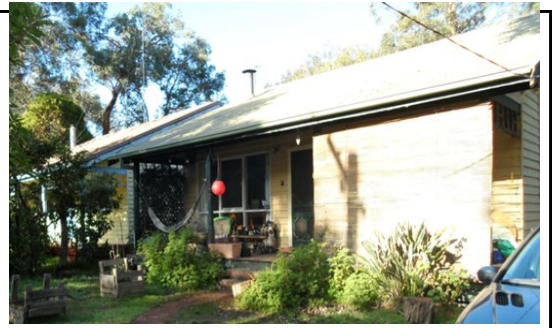
RIGHT: 14 Wilkins St.

Buildings rarely remain the same. All of the houses have been renovated and changed over the years and it is difficult to even recognize some of them now as ex forestry houses, but history tells us they were originally in Anglesea because of the pine plantations.