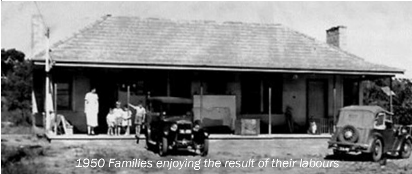
1950 Families enjoying the result of their labours

The tentative suggestion was to build three cabins, each capable of sleeping four people, and equipped with a stove, sink and shower. Land would cost between £50 and £150. Materials would cost £360..... If there were 50 subscribers, capital costs would be $10 each.