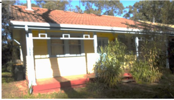
LEFT: 12 Wilkins St.