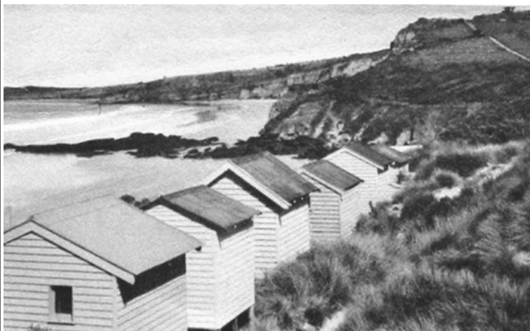
Bathing Box c.1930

Bathing Boxes are a rare commodity in Anglesea. In fact there is only one left. The others have all been destroyed over the years. The one remaining box is currently behind the Art House. It was moved there in 1960 when the Barrabool Shire ordered the removal of bathing boxes from the sand dunes. The dunes needed to be stabilized. Three boxes were moved to behind what was then the Scout Hall. Only one of these three still remains, and it needs to be moved to make way for extensions to the Art House. It is in extremely poor condition. The Historical Society needs to move the box to behind History House and then restore it to its original condition. We have to save it now.